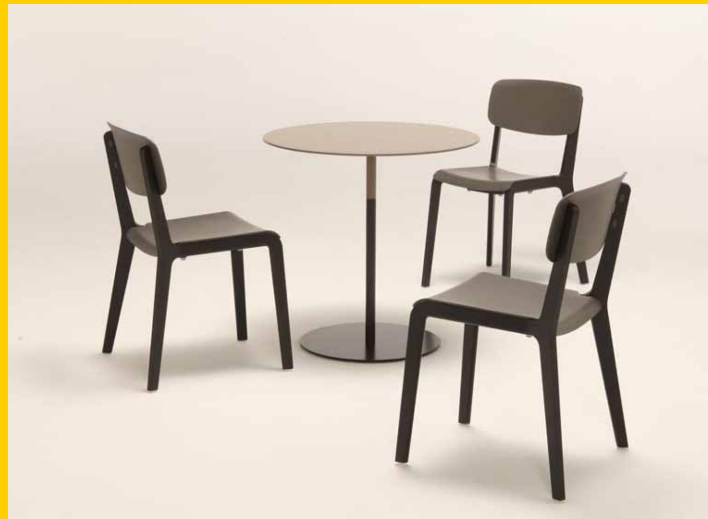
Diabolo table with Jonty chairs

Low tables, side tables, dining height tables, and bar height poseur tables. The emphasis is on colour and the mix and match capability of the two elements of top with top section of column, and bottom section of column with disc base, offering the opportunity for both colourful as well as more sober combinations when called for.