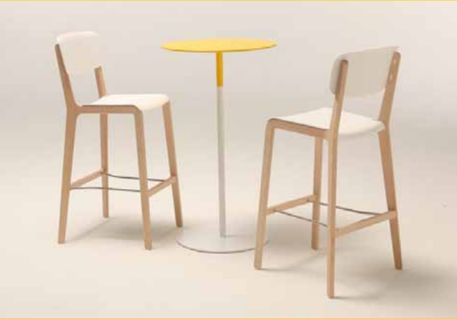
Diabolo table with Jonty stools