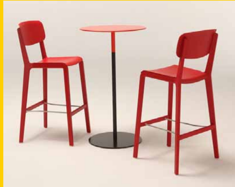
Diabolo table with Jonty stools

Diabolo is a collection of tables with a deceptive difference, available in four heights combined with four sizes of round tops. Created as a universally applicable range it will aptly accompany Drum, Jonty, and MIR seating ranges. Diabolo in its own right is a refined, pared back and elegantly simple table programme.