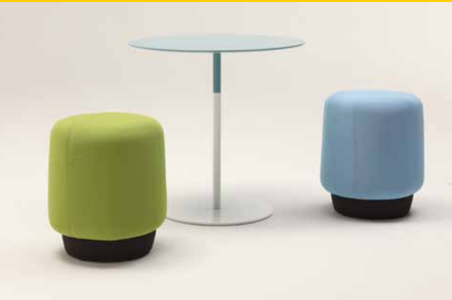
Diabolo table with MIR stools